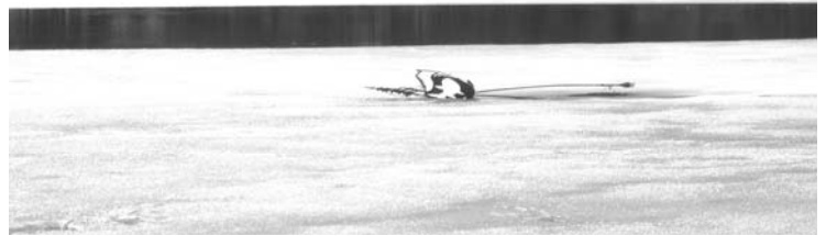
The Rock Drop structure, from which an actual rock was suspended, stubbornly resists it's ultimate plunge into the lake on April 14th. The rock and the structure were retrieved from the lake on the following weekend.