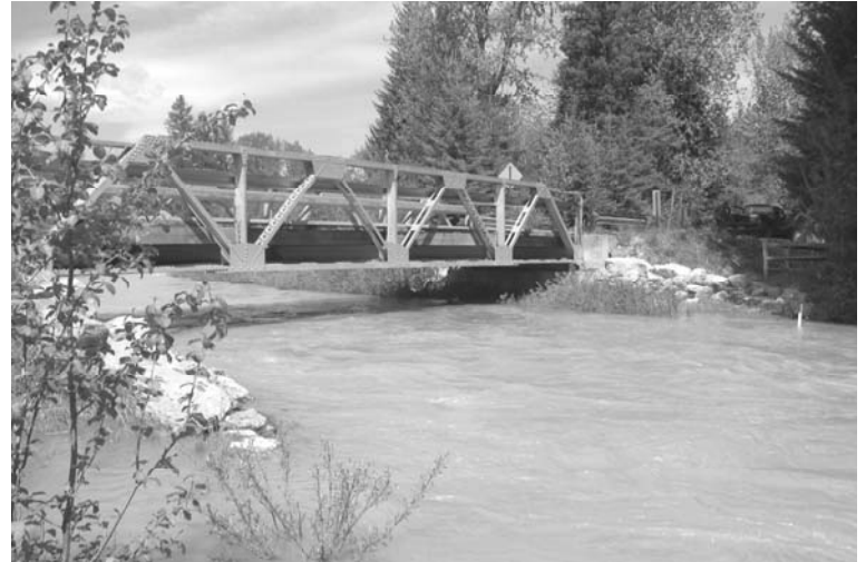
Water rises on Swift Creek at the DelRey Road Bridge in late May. At the time of the picture, the stream was flowing at approximately 700 cubic feet per second.