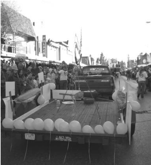
The WLI float displaying "The Rock Drop" during the Winter Carnival Parade.